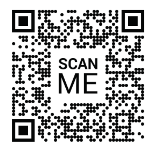
Figure 2: QR code linking to the digital Product Passport

did:ethr:spherity:testnet:0x828efeeaab06dd9541992b791d78e5d96cd35323 that we use in our example can be encoded into a 2D code. Figure 2 shows the respective encoding of the DID as a QR code. Using this code on product packaging can link the physical product to the digital product passport. It is also possible to use Concise Binary Object Representation based Serialization for Linked Data (CBOR-LD)<sup>16</sup> for the encoding and thus enlarge the information in the QR code and even make it verifiable. This technology is used for example in the W3C draft for vaccination credentials<sup>17</sup>.