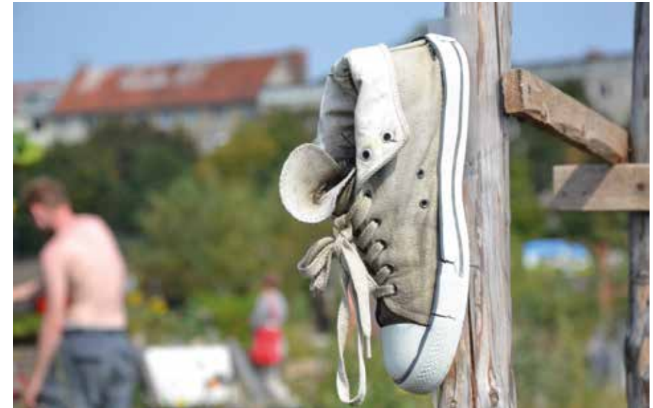
Figure 3.3.8 – Shoe bed at Allmende-Kontor Community Garden.

Applying futures literacy like the examples of practice reviewed in the previous section allows envisioning and creation of institutions, processes, technologies and business models that are sustainable by design rather than relying on cleaning up after the event. It also empowers actors to identify and speak up against the co-optation of new ideas, frames and narratives into the old paradigm so that their transformative potential is contained.