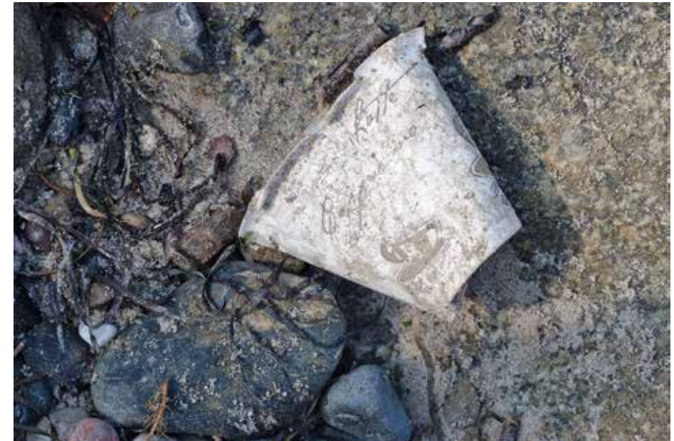
Figure 3.3.3 – Trash at the Beach.

With reference to respecting the laws of nature and their ability to sustain satisfaction of needs – the second key point of the sustainable development definition – the equilibrating market will also do the trick. Once increasing scarcity in natural resources drives up their prices, smart creative entrepreneurs will come up with alternatives to generate the same consumption options from cheaper sources or with different technologies. The way the environment was 'integrated' with economics