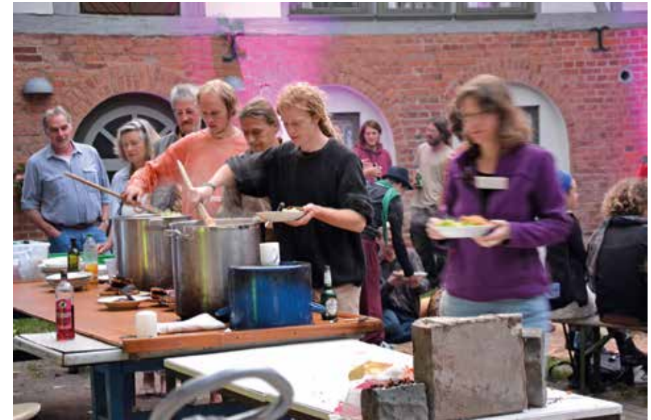
Figure 3.3.7 – Edible Cities Conference, Witzzenhausen, 2013.

what earth and ancestors have provided, everyone is conceived to be a co-proprietor of the wealth created.