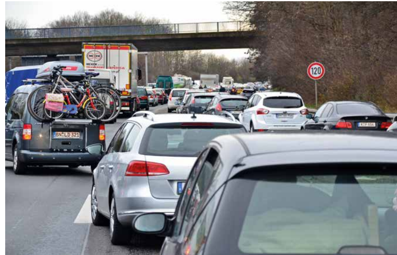
Figure 3.3.2 – Traffic Jam.

Each price therefore indicates ‘willingness to pay’ and provides a handy indicator of the utility created by a particular good or service: selfish people only pay as much as they really value something. Taken to the level of explaining entire economies and their development we find the origin of the third universal law, that of equilibrating competitive markets: every product finds a buyer once the price is right and human needs will therefore steer production in the right direction.