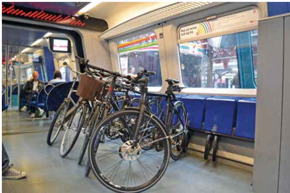
Figure 3.3.4 – Bicycle Stands in the Tram, Copenhagen.

In order to capture the effects of this framework for action and the role that the 'mental glue' of paradigms and mindsets play in defense of the status quo, political economist Antonio Gramsci developed the concept of hegemony in the 1930s. He coined this term because he wanted to find explanations for situations in which we observe a few enjoying far more wealth and freedom than