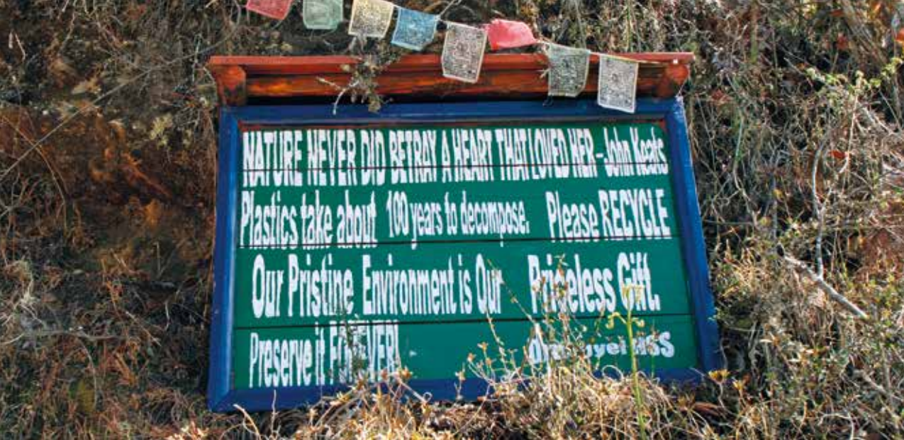
Figure 3.3.1 – Signpost in Buthan.

(any longer) in line with overarching goals and aspirations. Assessing the underlying assumptions and unstated ideas upon which social processes and institutions have been built, justified, maintained and adapted empowers us to break free from them if necessary. Reflexivity as an empowering and emancipating activity therefore forms a core of strategic engagement for changes to societal structures and institutions that have been set up and form ‘reality’ today. The World Social Sciences report 2013 coined the term ‘futures literacy’ when discussing leverage points for deeper and wider system changes for sustainable futures: