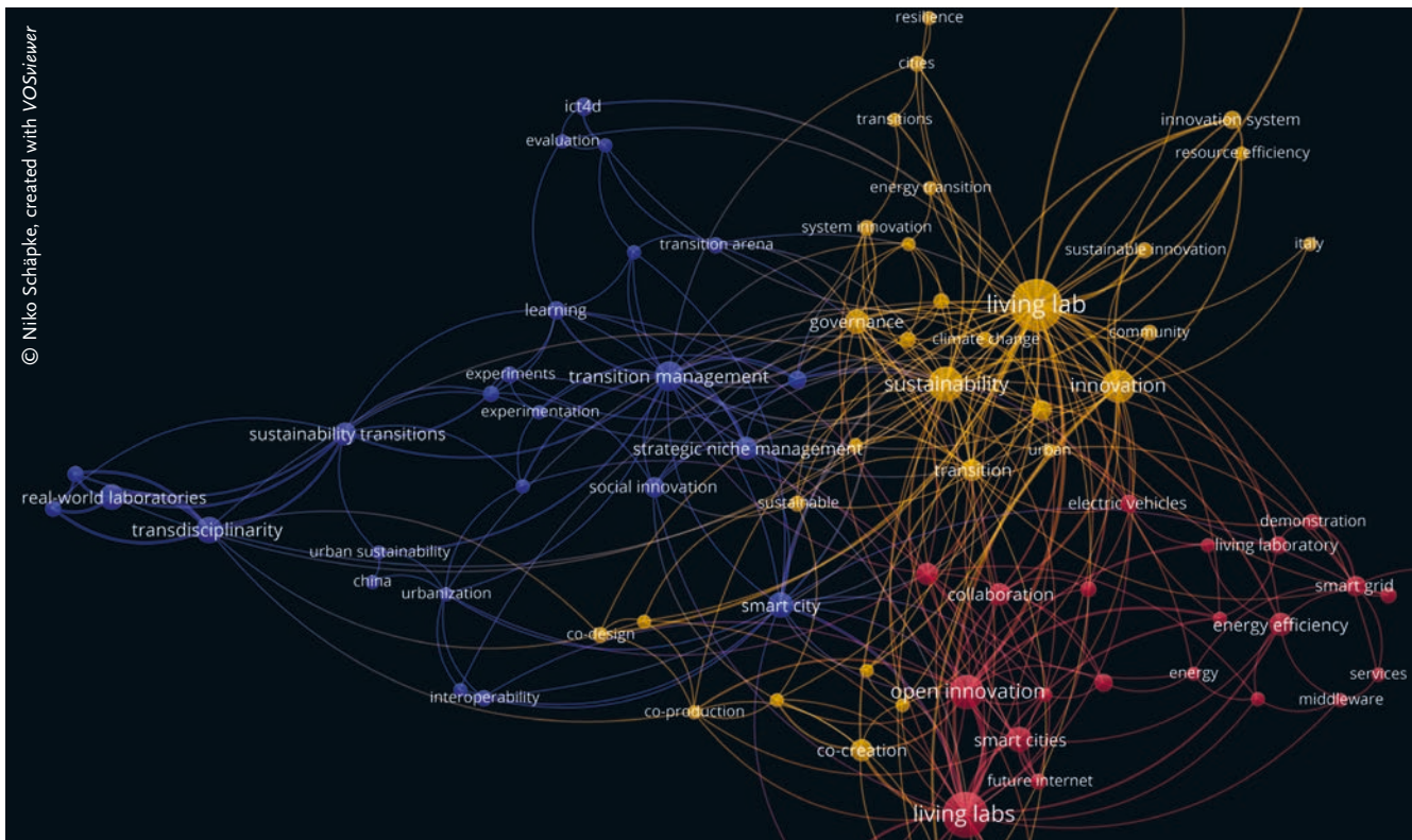
FIGURE 3: Semantic clusters of publications on LRW settings with relation to sustainability (core section of overall map, full map in supplement) 1 . Size of bullets represents frequency of occurrence of terms, size of arrows depict frequency of co-occurrence. Colours indicate different clusters of highly co-occurring terms.