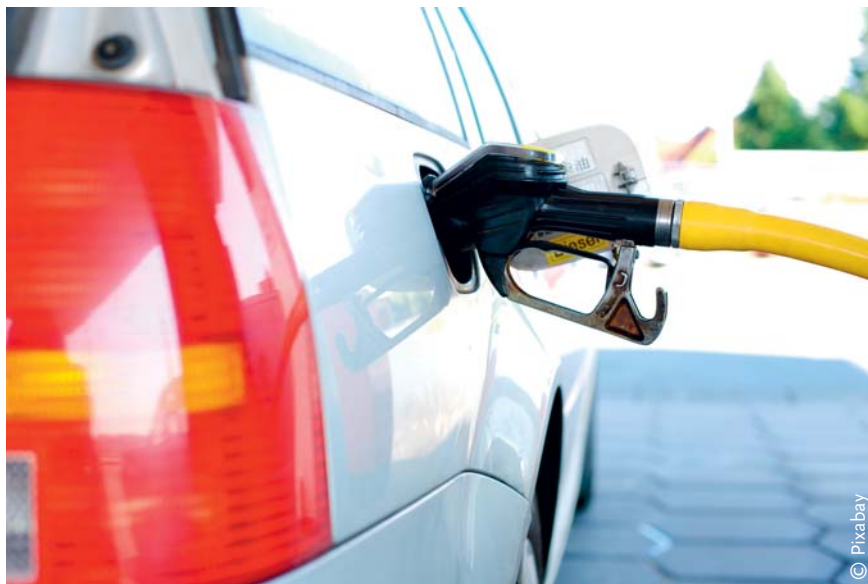
FIGURE 1: Fuel has one of the highest greenhouse gas intensity and hence leading to a high indirect rebound effect, when it comes to spending monetary savings from food waste prevention.

These aspects are also represented by figure 2 (p. 124). The dark and light green area together demonstrates the increasing environmental saving potential per household and income group, which could be realised by food waste prevention. The light green area shows the environmental impact caused by the re-spending of the monetary savings. The dark green area illustrates the actual environmental savings a household could achieve in the respective income group. The exponential increase also implies the decrease in rebound effect. Figure 2 illustrates that the higher income groups have the higher potential to contribute to the reduction of environmental impacts through food waste prevention.